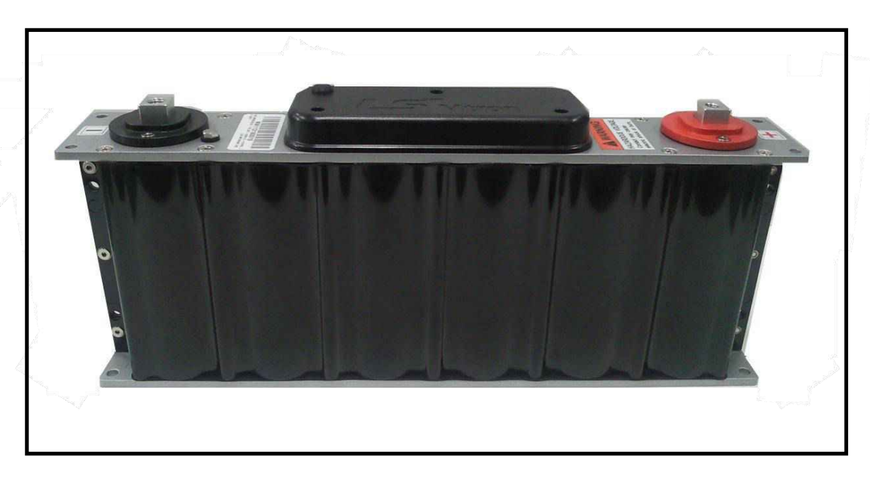
<Fig. 1> Product Image