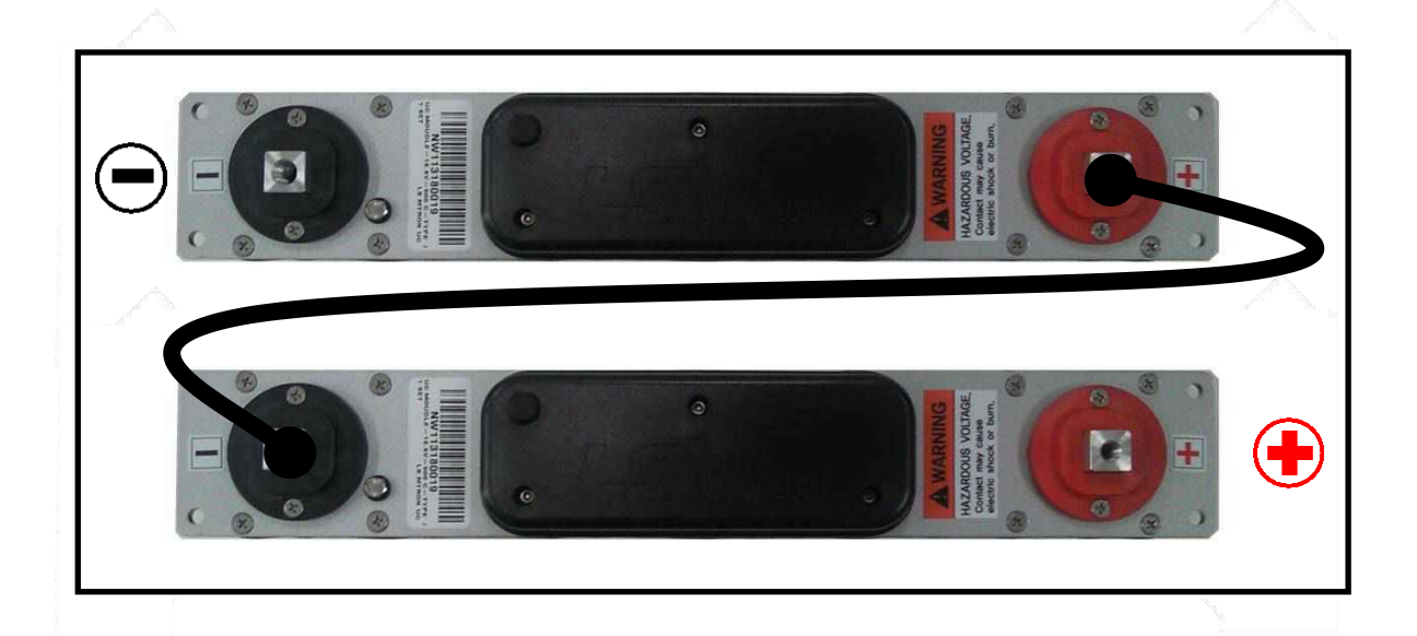
<Fig. 2> Series Connection of Modules