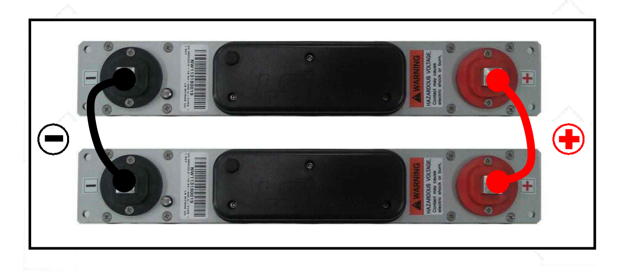
< Fig. 3 > Parallel Connection of Modules